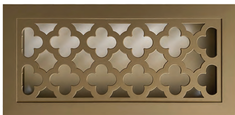
Code FOG-BF-FC Name Belfast Application Fixed Core with 20mm Flange