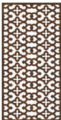
Code FOG-CO Name Collette

The DecoPanel range provides design customisation and versatility for any application and installation requirement.