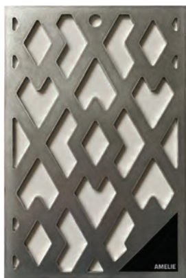
Code FOG-AM Name Amelie