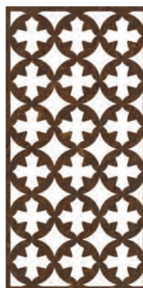
Code FOG-ME Name Mideival