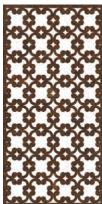
Code FOG-BE Name Bella