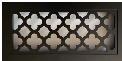
Code FOG-BF-FC Name Belfast Application Fixed Core with 20mm Flange

“FAB Ornate Grilles & Architectural Products are a specialist manufacturer in all architectural grilles whether they be for functional and / or decorative purposes.”