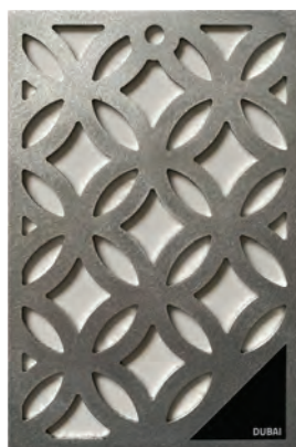
Code FOG-DB Name Dubai