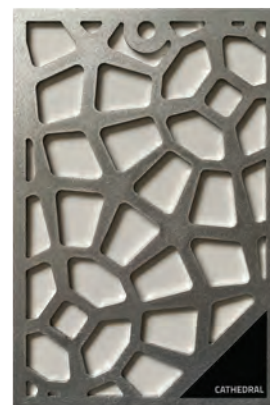
Code FOG-CT Name Cathedral