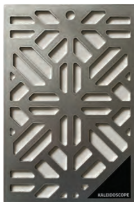
Code FOG-KL Name Kaleidoscope