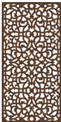
Code FOG-FC Name Flower Curls