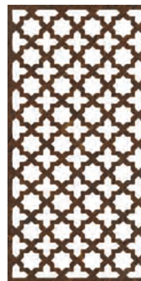
Code FOG-EG Name Egyptian