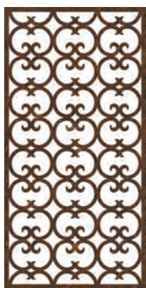
Code FOG-FR Name French Curl