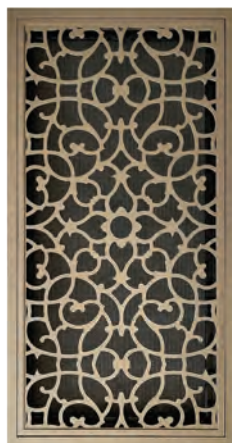
Code FOG-FC-HCF Name Flower Curl Application Hinged Core c/w Filter