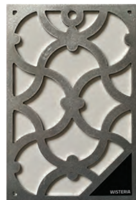
Code FOG-WS Name Wisteria