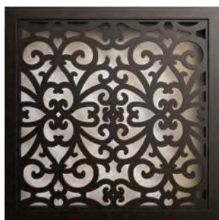
Code FOG-ER-FC Name Erebia Application Fixed Core with 20mm Flange

Whether your requirement is for a singular custom made grille or multiple grilles of varying styles, shapes and sizes, FAB Architectural is well placed to provide superior craftsmanship, flexibility and responsiveness to the customer's needs.