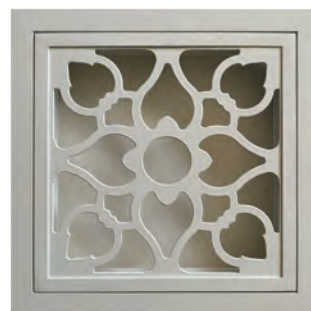
Code FOG-FC-RC Name Flower Curl Application Removable Core