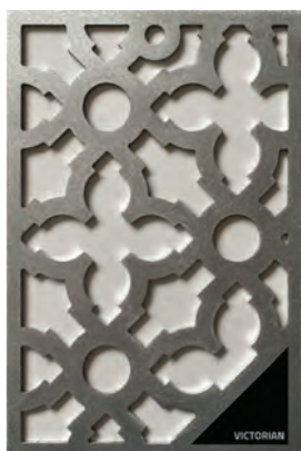
Code FOG-VT Name Victorian