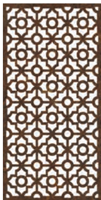
Code FOG-CS Name Cusick