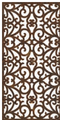
Code FOG-ER Name Erebia