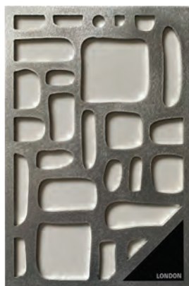
Code FOG-LN Name London