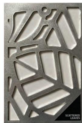
Code FOG-SC Name Scattered Leaves