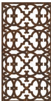
Code FOG-AN Name Arabian Nights