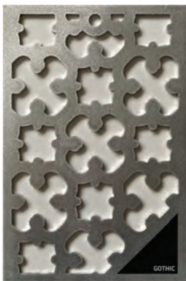
Code FOG-GO Name Gothic

Specialist fabrication includes a variety of materials including Aluminium and Steel. Finishes include; Powder Coating, Anodising, Polished and Plated.