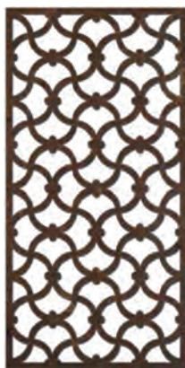
Code FOG-WI Name Wisteria