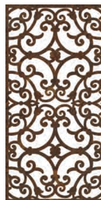
Code FOG-BH Name Beethoven