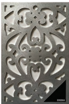
Code FOG-ER Name Erebia