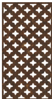
Code FOG-BK Name Becker