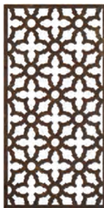
Code FOG-VT Name Victorian