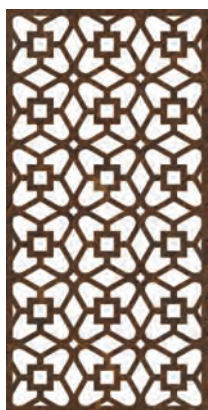
Code FOG-DF Name Diamond Flower