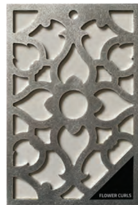
Code FOG-FC Name Flower Curl