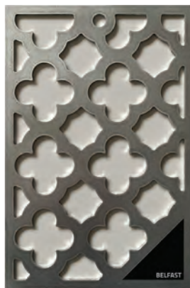
Code FOG-BF Name Belfast