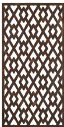
Code FOG-AM Name Amelie

“ FAB Architectural Products can also incorporate unique designs inspired by the customer. Custom manufacture is our speciality and our experienced staff are committed to assisting with unique or specific designs from concept through to manufacture and delivery. ”